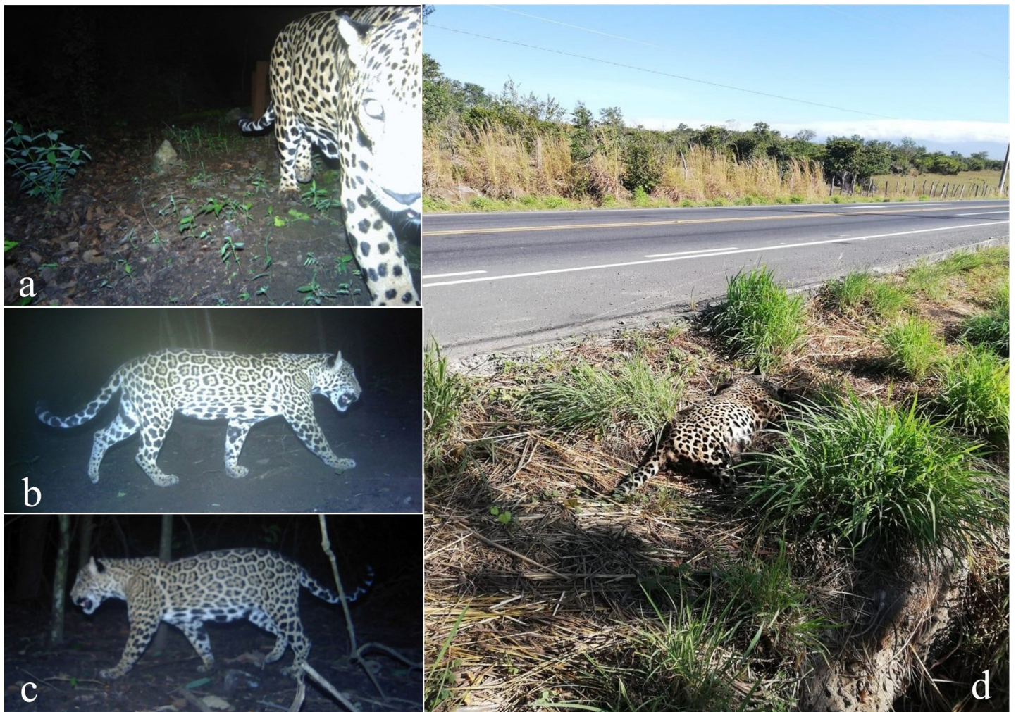
Figure 2. Photographic records of jaguars recorded in Guanacaste Conservation Area, Costa Rica: a) an adult male (Male 1) and b, c) an adult female (Female 1) recorded with camera traps in Península Papagayo; d) photographic record of an adult female roadkill, photo by L. C. Hernández Jénez.

In summary, our findings indicate the presence of jaguars in Península Papagayo. However, these findings have raised important questions, such as: 1) Is the presence of jaguars in this area seasonal (e.g., related to the sea turtle nesting season up north) or permanent throughout the year? 2) Does Península Papagayo serve as a habitat patch that facilitates jaguar dispersal throughout the coastal habitat of Guanacaste Conservation Area? Further research into these questions is necessary for the effective management of the species and its habitat in Península Papagayo and Guanacaste Conservation Area.